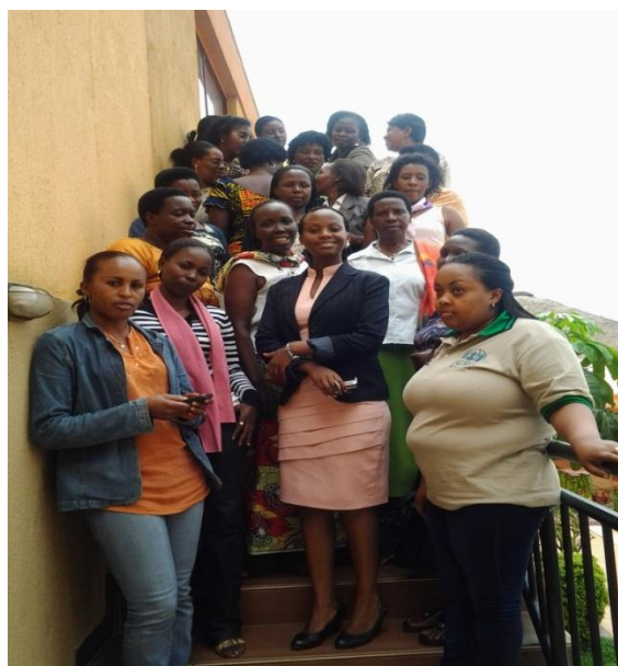
Members of the Rwanda WLHIV network after the stakeholder's meeting attended the stake holder meeting

In Tanzania, although a national stakeholder's and consultation meeting similar to that which was held in Uganda was taking place women living with HIV had not been invited to the meeting , ICWEA lobbied through other partners for representation in the meeting and two women living with HIV participated in the meeting