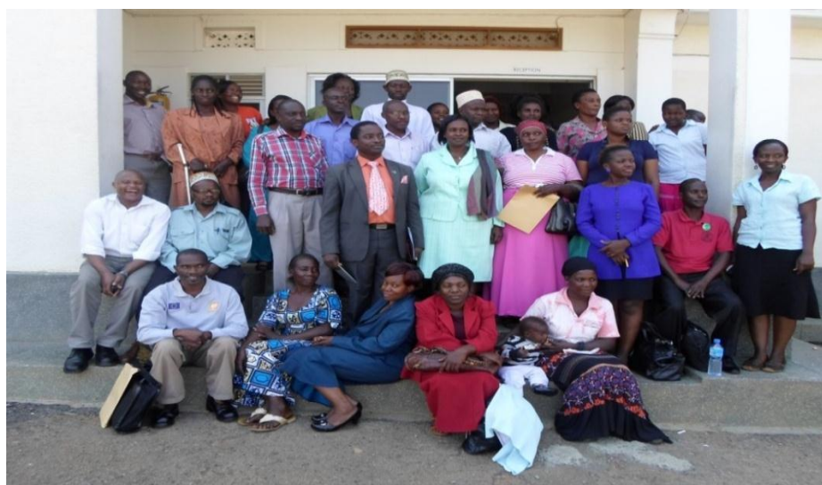
Participants from a Dialogue meeting in Masaka

One of the major issues that were raised by both the media and the Parliamentarians was the human rights violations of women and women living with HIV and especially coerced sterilisation which was still reported as a big issue in Kenya especially in Western Province that hinders women from accessing Antenatal care services as they fear being coerced into sterilization