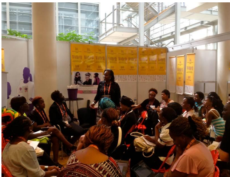
ICW Members Conducting a panel session in the Women's Networking Zone at ICASA.

Three poster presentations and one oral presentation were made. The presentations focused on the work that ICW had engaged in specifically the Assessment on the Barriers of Access for Family planning services for women living with HIV in Uganda, Assessment on the availability and accessibility of TB/HIV services for women living with HIV and the eMTCT. Below are some of the photos of the Posters presented during the 17 th ICASA, 2013.