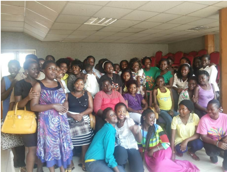
Young Women living with HIV in Uganda with ICW staff after formation of their network

ICWEA held a meeting with 60 young women living with HIV (YWLHIV) from Mbarara, Masaka, Wakiso, Busia and Kampala in Uganda who had earlier participated in Young Women's Dialogue meetings; to discuss and build consensus on advocacy strategy and advocacy plan for better sexual and reproductive health and rights for young women living with HIV in Uganda. An advocacy Implementation plan was developed by YWLHIV 2014