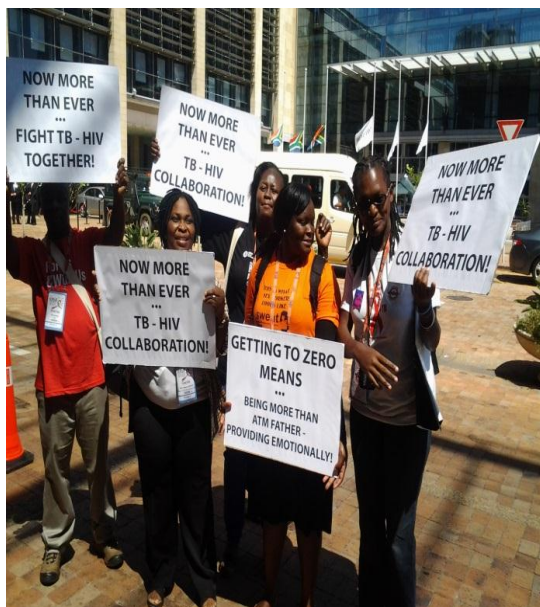
ICWEA program staff participating in an Advocacy campaign ICWEA TB//HIV activities