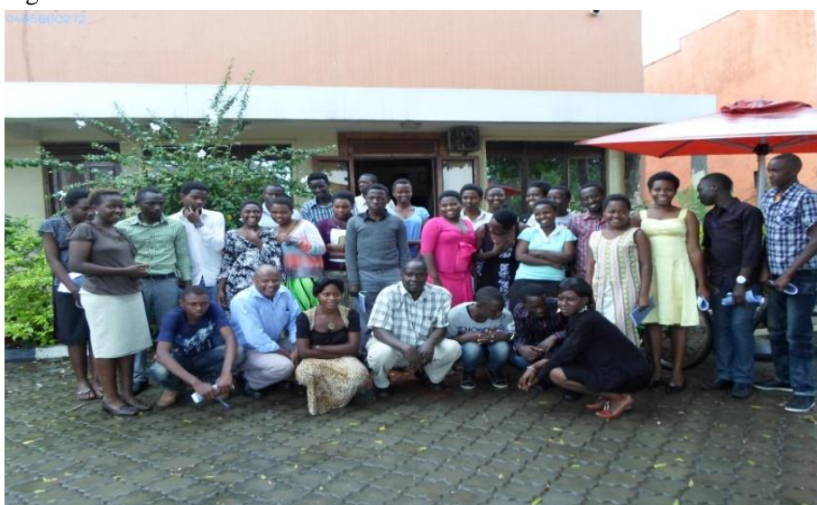
Participants from NIKIBASIKA program who attended the SRH training in Kasese

The facilitators held a meeting with the staff of the Project to discuss some of the key observations from the training and to also giver feed back to the project team so as to address some of the key issues arising from the training.