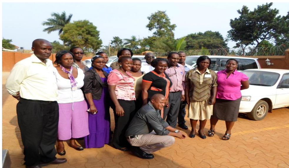
CSO representatives who attended the TB/HIV training at Eureka Hotel, 14th August 2013

The trained advocates are already articulating TB issues in key meetings as demonstrated by the advocates that participated in the 2 days National Joint AIDS Review meeting in September 2013, and raised the importance of TB constituency/program representation in the National AIDS review meeting.