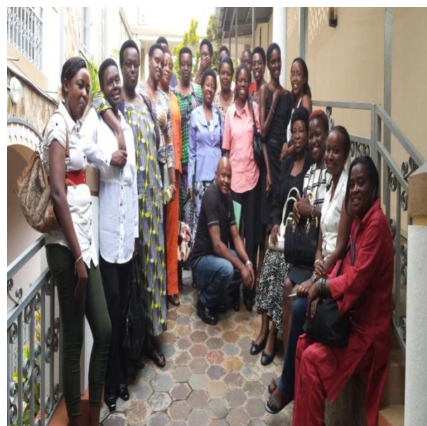
Women in Burundi who

One day meetings were held for the women to reflect on the Stakeholders' meeting and to strategically position themselves to contribute meaningfully in the planning, implementation and monitoring of the PMTCT Program by identifying the key priority areas to focus on for the coming one year and drew work