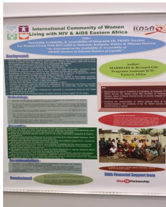
An ICWEA poster presentation on

Three poster presentations and one oral presentation were made. The presentations focused on the work that ICW had engaged in specifically the Assessment on the Barriers of Access for Family planning services for women living with HIV in Uganda, Assessment on the availability and accessibility of TB/HIV services for women living with HIV and the eMTCT. Below are some of the photos of the Posters presented during the 17 th ICASA, 2013.