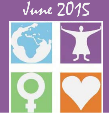
The International Community of Women Living with HIV&AIDS Eastern Africa (ICWEA)

-HIV and Aids Uganda Country Progress Report; 2013