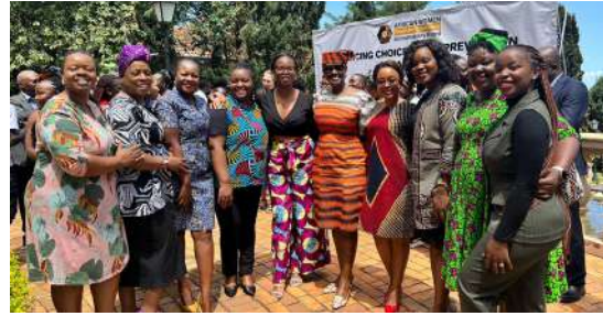
The African Women's HIV Prevention Community Accountability Board (AWCAB) with UNAIDS Executive Director Winnie Byanyima